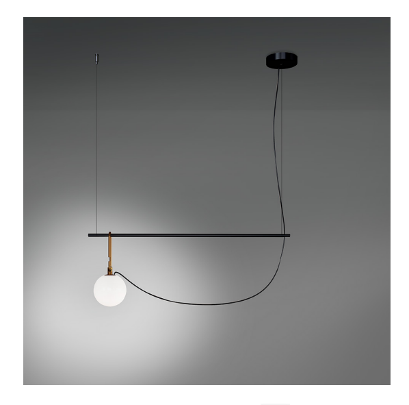
IP 20 ☐ 《 ( € Dimmerable: +① -